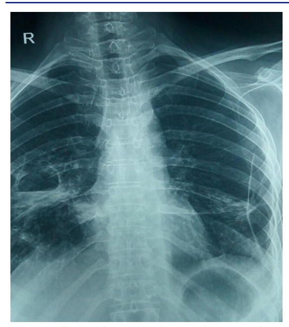
Figure 4. Follow up chest x ray of patient showing resolution of lesions .left sided pneumothorax is also seen

suggested the diagnostic criteria for GPA, including oral or nasal ulcers or purulent bloody flux, CXR findings (e.g., pulmonary nodules or cavitation), abnormal urinary sediment, and extravascular granulomas (3). The presence of two or more of these items has a sensitivity of 88% and a specificity of 99% in the diagnosis of GPA (1, 3). Our patient met the criteria for two items, namely, abnormal findings on CXR and vasculitis due to skin biopsy.