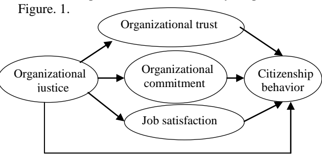
Figure1: Conceptual model

The conceptual model of the study is presented in