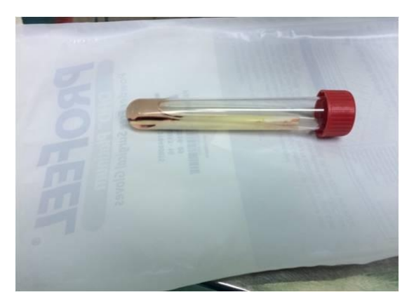
Figure 2: Infected catheter that was removed

Patient was candidate for heart surgery. In Operating room Dialysis Catheter was removed (Figure 2).