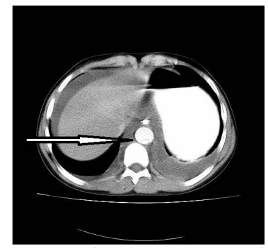
Figure 3. The next cut of computed tomography scan showing aortic wall flap

abdominal pain and dilated small bowl loop in the CT scan, diagnostic laparotomy was carried out; during surgery, ischemic blackish smallbowel loop was noticed. The patient died due to cardiac arrest.