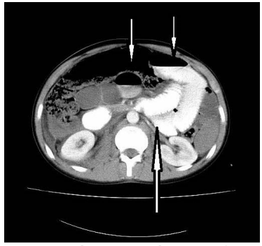
Figure 2. The arrows show significant landmarks of bowel obstruction