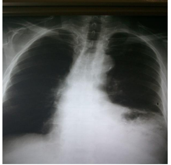
Figure 1. Consolidation in lower zone of left lung