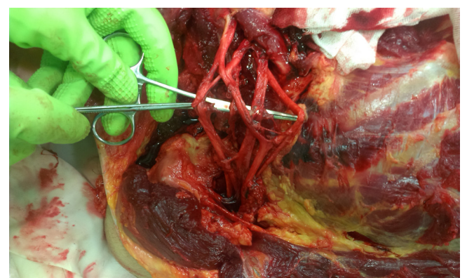
Figure 1. Normal Brachial Plexus pattern.

Initially an incision was made in the lateral section of sternocleidomastoid muscle and continued to above the clavicle to mid-clavicle (supra clavicular zone), where the origins of the long thoracic and suprascapular nerves were assessed.