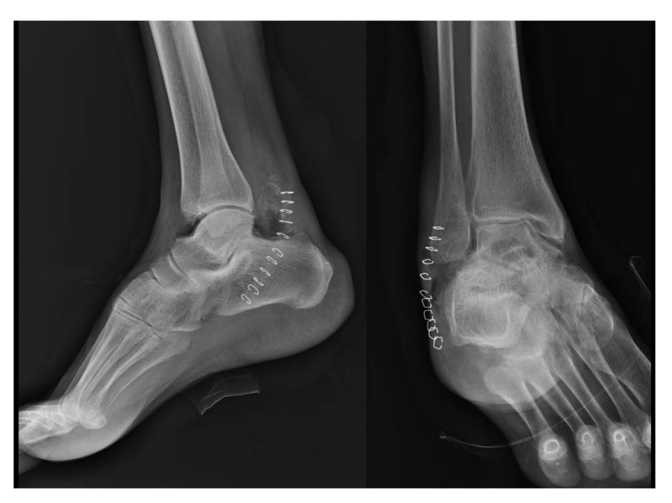
Figure 8. Post operative radiographs showing the complete excision of the tumor.

Osteochondromas of the talus presenting as TTS is a rarity by itself. Although most of the osteochondromas are being treated conservatively, those presenting with multiple swellings, restriction of joint movements and