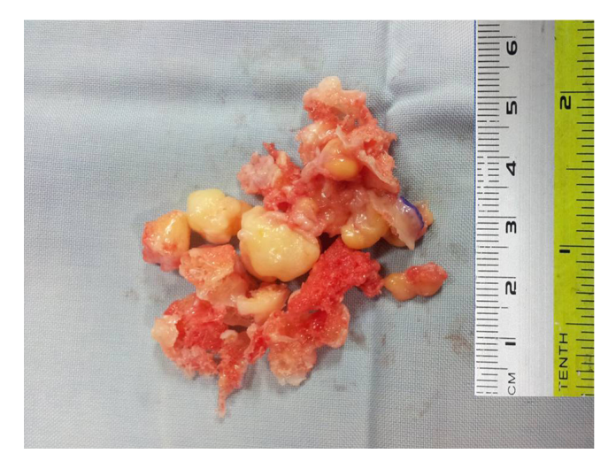
Figure 6. Excised multiple bony outgrowths from the talus.

reported an atypical osteochondroma that originated from the posterior aspect of the talus in a 34-year-old male. Erler et al. (9) reported a case of an osteochondroma located on the dorsum of the talus.