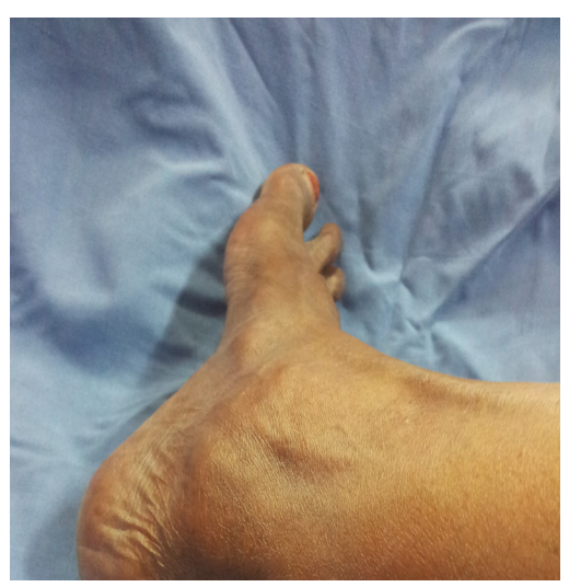
Figure 1. Clinical photograph of the right heel showing the swelling around the ankle.

EXTENSIVE OSTEOCHONDROMA OF TALUS PRESENTING AS TARSAL TUNNEL SYNDROME