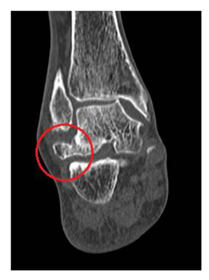
Figure 4. Coronal CT image of right ankle joint showing a bony outgrowth from the lateral aspect of the body of talus (circled).

An osteochondroma of the talus was first reported in 1984 by Fuselier et al. (7). In 1987, Chioros et al. (8)