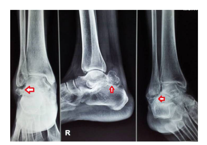
Figure 2. Radiographs of the antero-posterior view of the ankle showing a bony outgrowth from the lateral aspect of talus just below the lateral malleolus(arrow). Lateral view shows a large bony outgrowth from the posterior aspect of the body of the talus (arrow).

Patient was taken up for excision of exostosis. In view of extensive exostosis on the posterior and lateral side of the talus, it was decided to approach the talus from the postero-lateral side. A 10 cm curvilinear incision