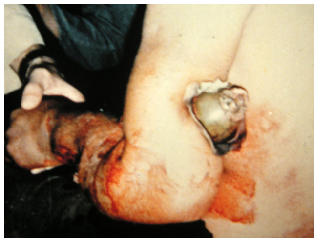
Figure 5. The left upper limb is hit by an unexploded mortar shell. The head of the mortar is seen in the posterior aspect of the arm.