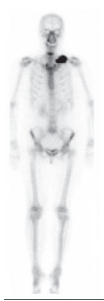
Figure 1. Whole-body anterior image shows a focus of intensely increased uptake in the proximal and mid-portion of the left clavicle

area of the blastic mass (6). The most important differential diagnosis is parosteal osteosarcoma. In comparison with parosteal osteosarcoma, osteoma usually presents as a homogeneous and dense lesion without an accompanying softtissue mass. cortical destruction. intramedullary invasion (1). This is perhaps best appreciated on CT scans (1). Integrated SPECT/CT imaging supplies both functional and anatomic information about bone: the SPECT imaging improves sensitivity compared with planar imaging, the CT imaging provides precise localization of the abnormal uptake, and information on the shape and structure of the abnormalities improves the specificity of the diagnosis (7).