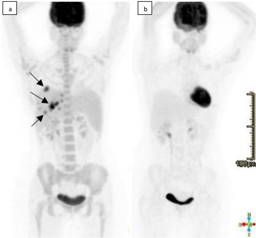
Figure 2. Maximum intensity projection (MIP) FDG-PET images. At the initial neutropenic stage (a.left) showing several FDG-avid liver lesions (arrows). Complete resolution of radiotracer uptake few weeks following treatment (b.right)

A CT-guided core biopsy was performed for the most FDG-avid lesion (Figure 3). The biopsy showed noncaseating granulomatous inflammation that was negative for acid fast stain, GMS (Tb and pneumocystis carinii) and malignancy (Figure 4). Patient was therefore placed on on Fluconazole, Valtrex and Tavanic as per the