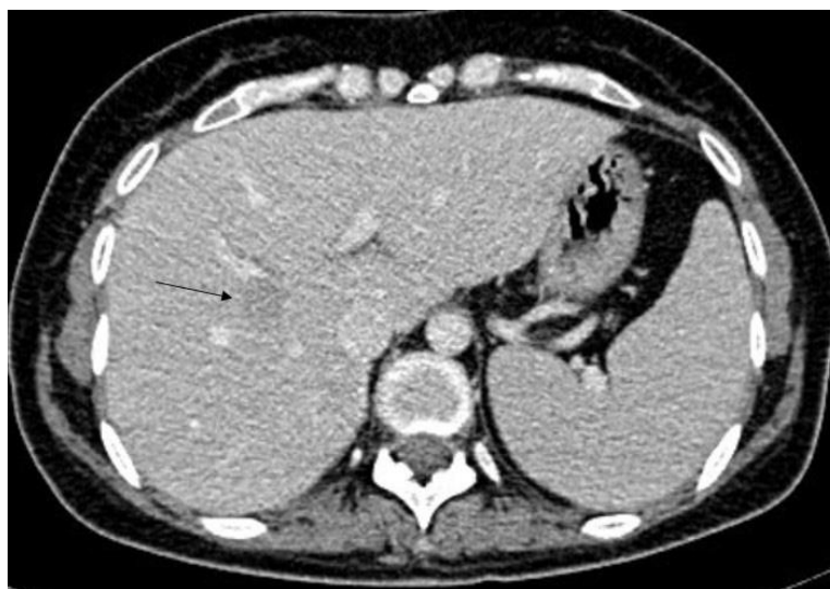
Figure 3. Axial CT image of the abdomen in late arterial phase for a CT-guided core biopsy denoting the hypodense lesion of segment VIII to be biopsied (arrow). To note intravenous contrast was administered prior to the CT-guided biopsy for better visualization of the previously described hepatic lesions under investigation

oncology team recommendations. Repeat FDG PET/CT after 5 weeks for continued surveillance of disease progression revealed complete resolution of the previously demonstrated multiple FDG-avid liver lesions and splenic uptake.