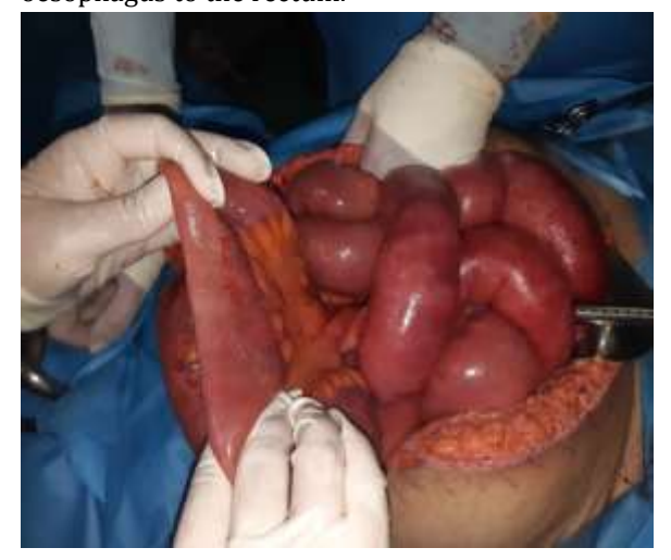
Figure 2 . Appearance of severe bowel distension

evacuation of intestinal contents from the oesophagus to the rectum.