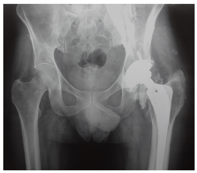
Figure 1. X-ray both hips with pelvis showing severe osteolysis and ill-defined increased radio opacities around the neck and periacetabular region of left prosthetic side extending upto the iliac region.