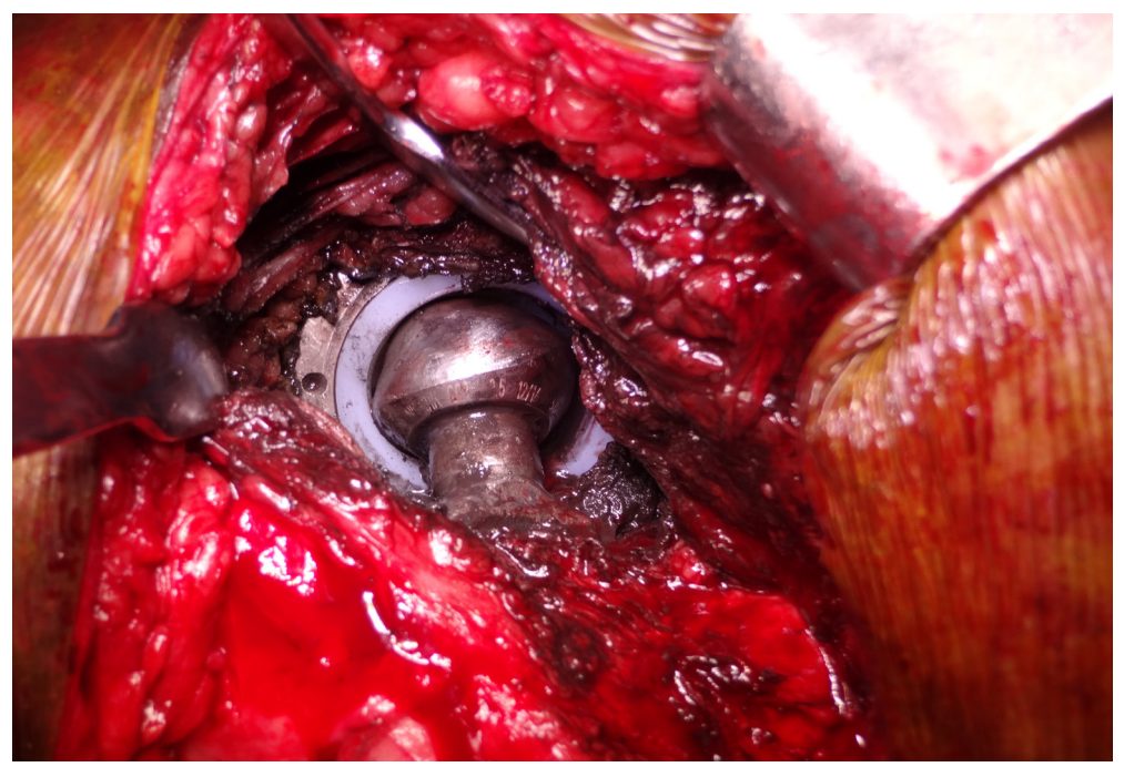
Figure 3. Intraoperative picture showing grossly distorted femoral head and the polyethylene liner. Note the black granular deposition in the surrounding soft tissue.

Fetal Rhabdomyoma in a 31-year old patient