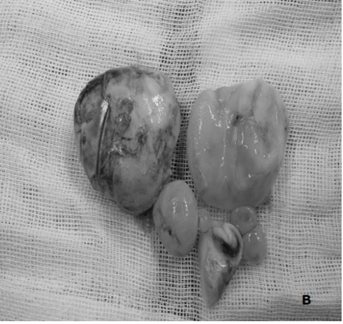
Figure 2. Resected specimen (A) and hydatid cyst of the chest wall (B)